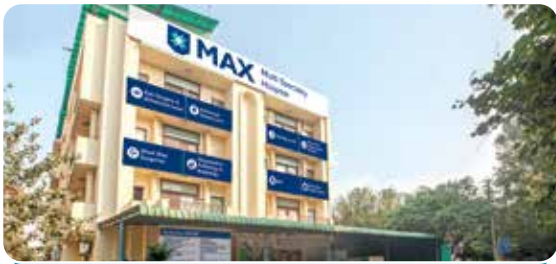
Max Multi Speciality Centre, Panchsheel Park