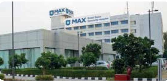
Max Smart Super Speciality Hospital, Saket