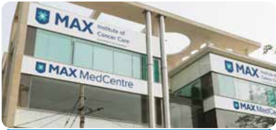
Max MedCentre, Lajpat Nagar