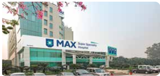
Max Super Speciality Hospital, Saket (West Block)