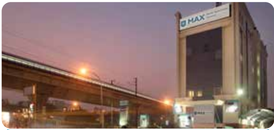
Max Multi Speciality Centre, Noida